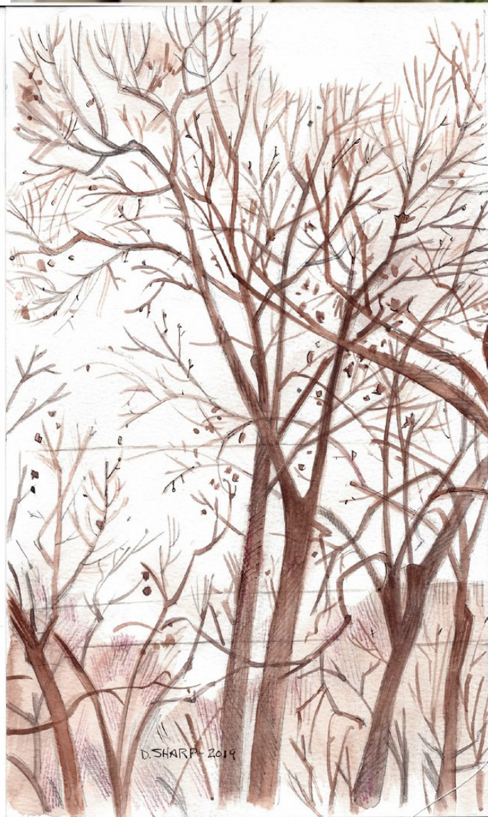
View from my old office window at Local 104